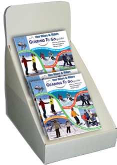
Retail Sales DVD (includes display case)